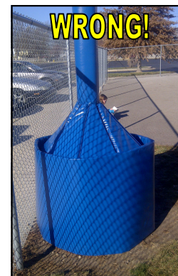
Cone Pad is reversed

A PROPERLY INSTALLED PAD IS AN ATTRACTIVE SAFETY MEASURE !